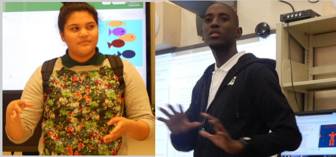
CodeMasters from Central and Carol City High demonstrate their JavaScript coding projects.

At the showcase, students at Carol City and Central High, all beginning coders, demonstrated drawings, web pages and animations created during the first two